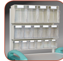
Tilt Bin Organizer