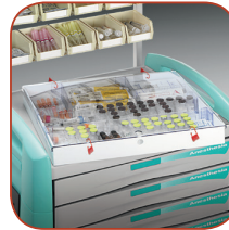
Divided Drawer Tray