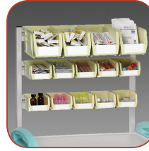
Bulk Storage Bins